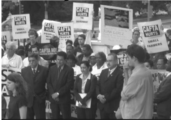
CISPES brought an anti-CAFTA bus caravan to Washington the week before the vote in the House

When CAFTA was announced three years ago, few people had heard of it, while many of those who had claimed it wasn't a battle worth fighting. Certainly,